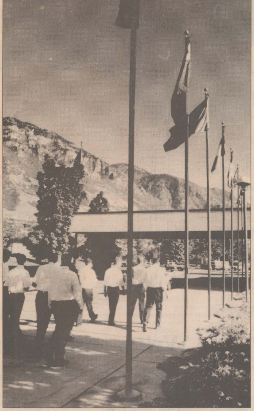
THE MORMON BATTALION: Missionaries enter the Missionary Training Center in Provo, Utah, to learn and prepare for two-year service. Many BYU students serve additional "missions" by being teachers at the MTC.

But often keeping the missionaries interaction with missionaries. "It